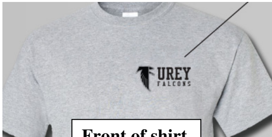
Front of shirt