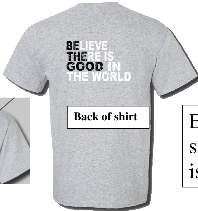
Back of shirt