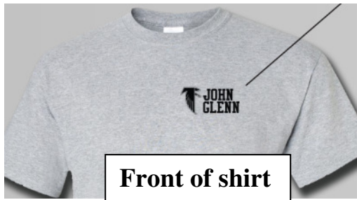
Front of shirt