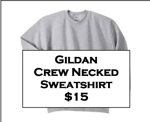
GILDAN CREW NECKED SWEATSHIRT $15