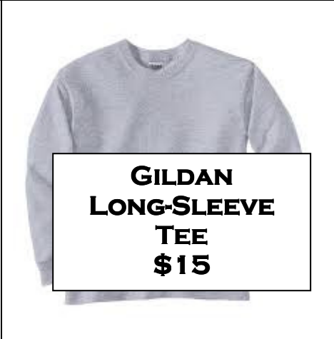
GILDAN LONG-SLEEVE TEE $15