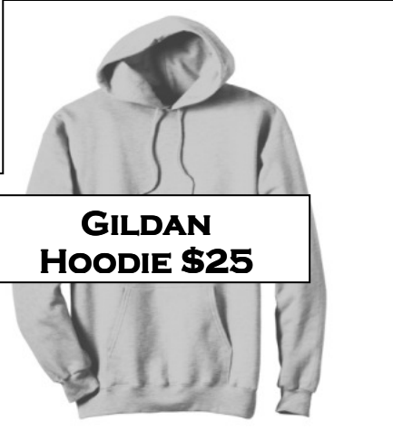
GILDAN HOODIE $25

Order forms for other JGSC School Shirts (& shirts with no logo) are available in each school office and on NLES website.