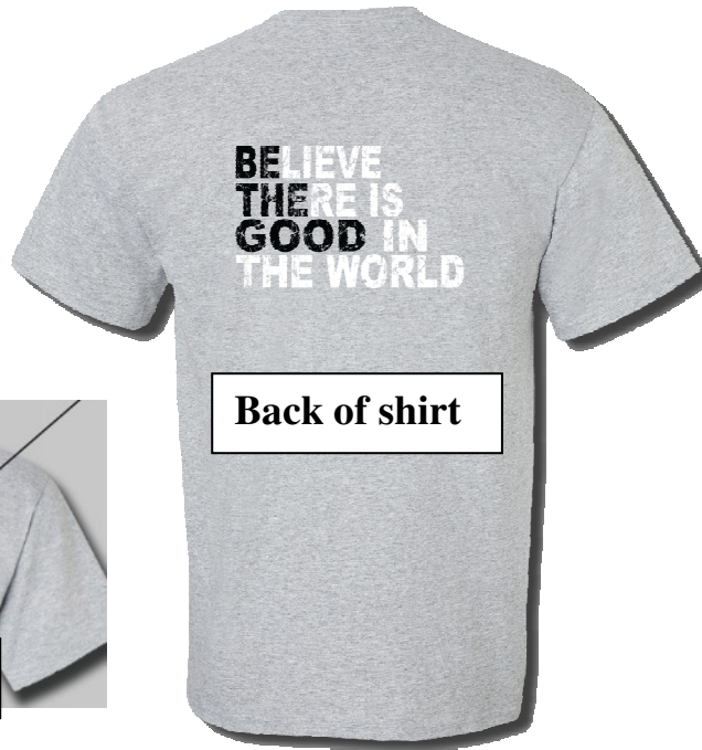
Back of shirt