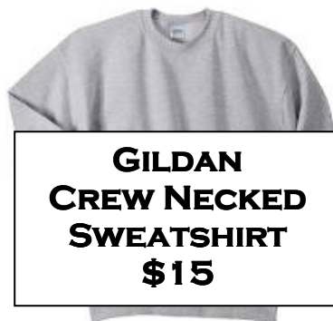
GILDAN CREW NECKED SWEATSHIRT $15