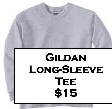
GILDAN LONG-SLEEVE TEE $15