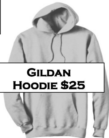
GILDAN HOODIE $25

Order forms for other JGSC School Shirts are available in each school office and on NLES website.