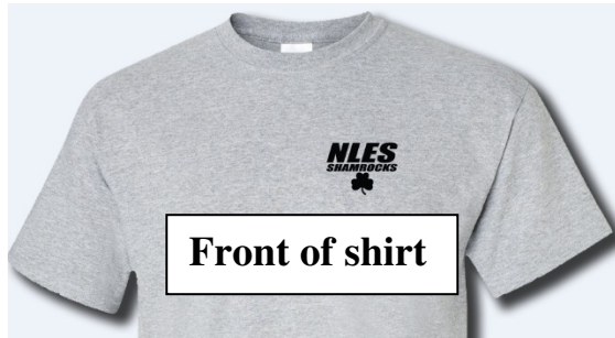
Front of shirt